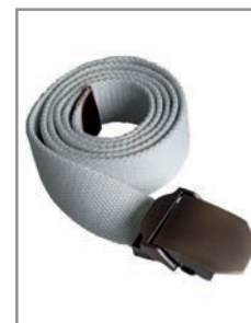
KXWWBW White 140 x 4 cm