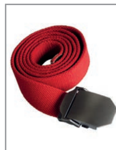
KXWWBR Red 140 x 4 cm