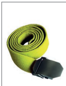
KXWWBG Yellow 140 x 4 cm