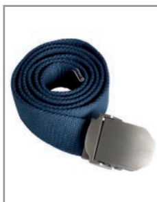
KXWWBN Navy 140 x 4 cm