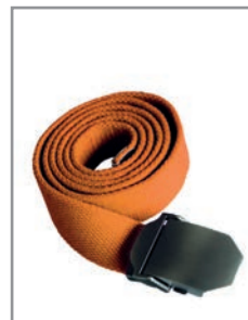
KXWWBO Orange 140 x 4 cm