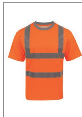
KXPCSHIRTO Hi-Vis Orange (Front) S - 7XL