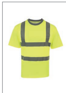
KXPCSHIRTG Hi-Vis Yellow (Front) S - 7XL

Industry, transport and logistics, events, construction, public authorities, airports, security