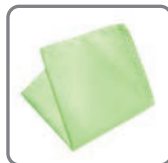
KXHKLGRE21 Lime Green