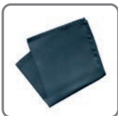
KXHKDGRE21 Dark Green