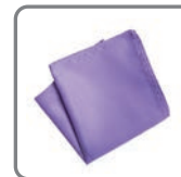
KXHKBR21 Pale Violet