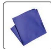
KXHKDV21 Dark Violet