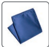
KXHKDB21 Dark Blue