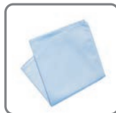
KXHKLB21 Light Blue