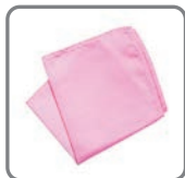
KXHKLP21 Light Pink