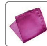
KXHKDP21 Dark Pink